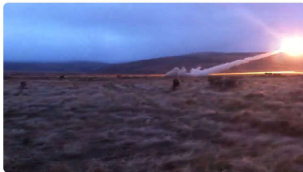
5-3 / A 1-94 HIMARS live fire at Yakima Training Center Nov

The solution: what options would you suggest to the faculty member as your institution's copyright specialist?