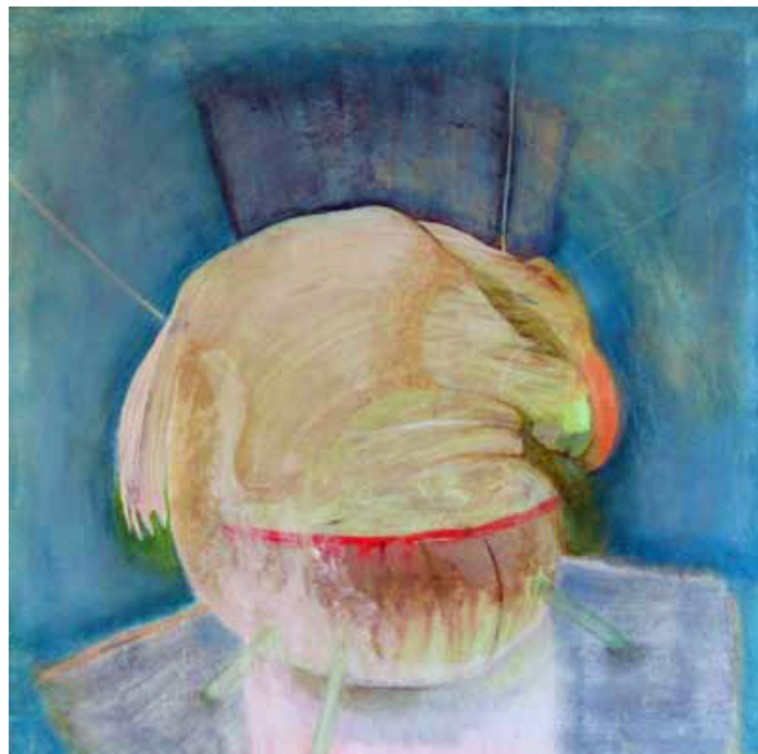
Figure 3. Heavy Dance , 2008, oil on masonite panel, 24 x 24".

Looking at Heavy Dance now, it is clear to me that even though I was no longer emphasizing a connection to Rothko or Hofmann, their influence is still present in the paint handling and use of colour as an emotional communicator. The challenge became finding figures through process and complicating their relationships with the ground and with the viewer, through scale, colour, mark, and viewpoint. These were the issues I was concerned with upon application to the MFA program at the University of Lethbridge.