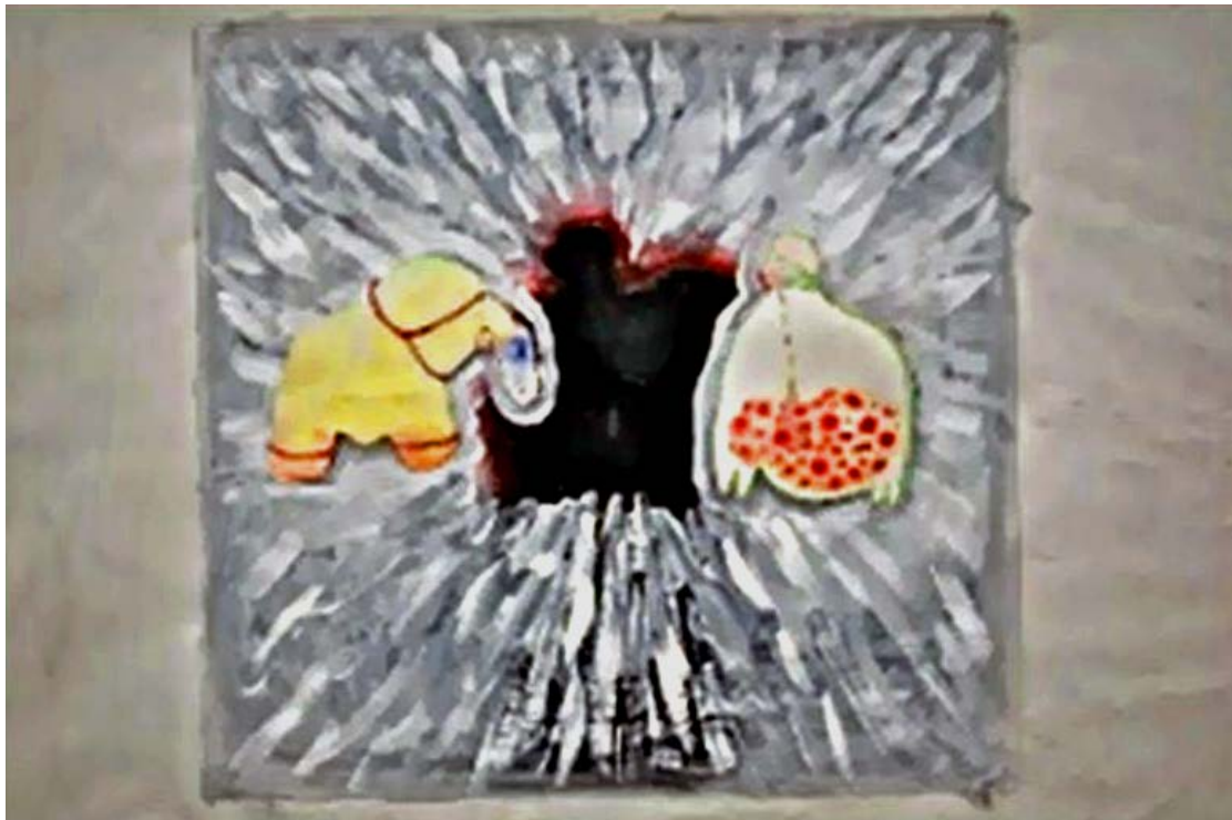
Figure 6. Masky Beast (Still Frame), 2010, 2:12 run time.

I subsequently produced Masky Beast ( Figure 6 ), a piece in which a conversation takes place between two characters. More narrative in form than Beast , Masky and Beast confront one another, interchange, become one element, and then separate. This work is a clear examination of relationships with others and with ourselves. Its themes are identity, gender, and physical representation. Masky and Beast are two parts of the self. Materially made of the same substance, they nonetheless conform to the illusion of separation and difference.