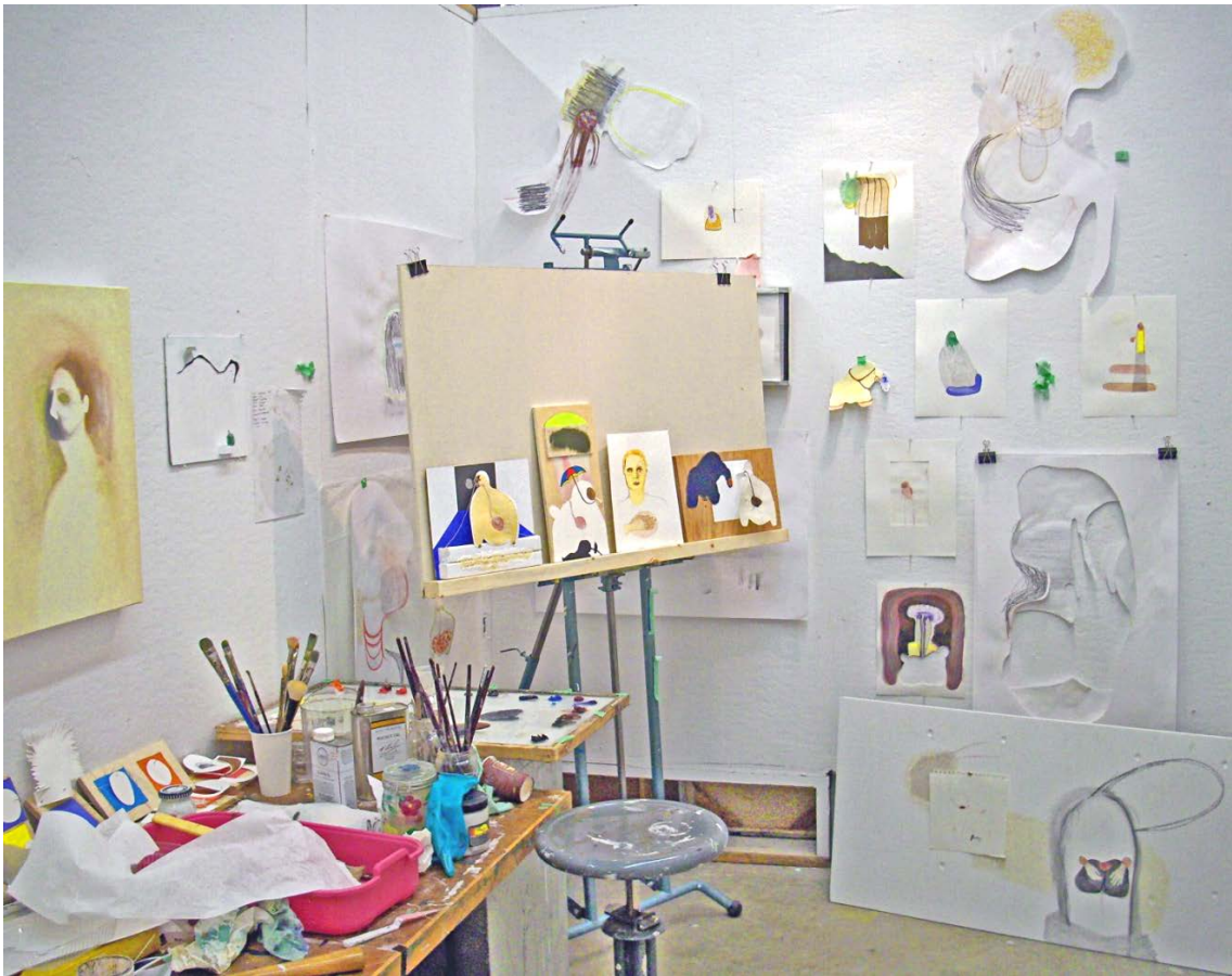
Figure 5. Untitled (Studio Image) , 2010, mixed media, dimensions variable.

observation. They came from an intuitive process of image making, a combination of Guston's and Bourgeois's influence in process, Dzama's in style. These figures, or characters, began to seem trapped in their paper surroundings; the rectangular white sheet limited what they could possibly be (always a drawing). I started cutting them free and arranging them around the studio, experimenting with how the cut-outs could interact with the space, as well as with the non-cut-out works ( Figure 5 ).