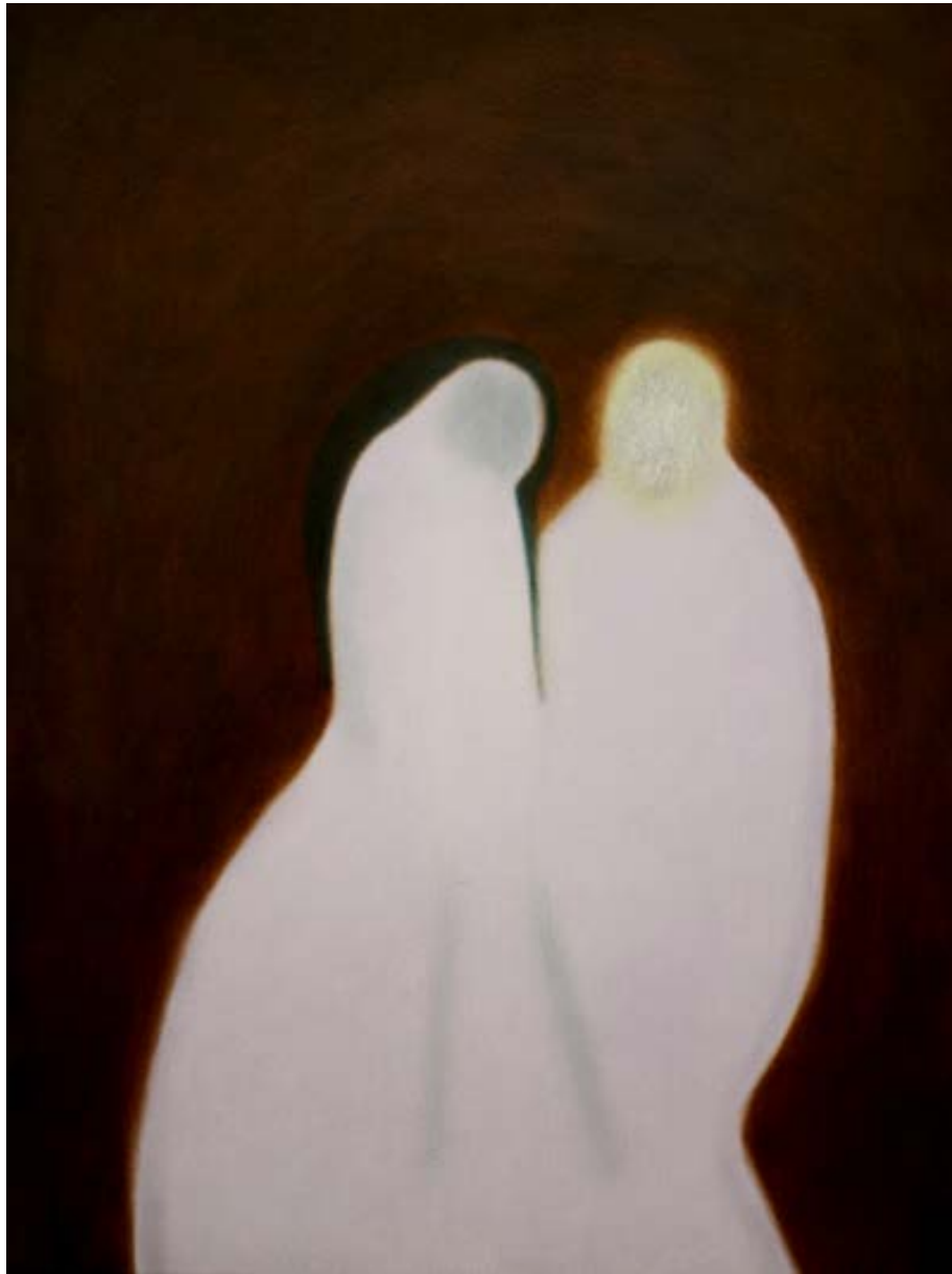
Figure 1. Soft Hands , 2010, oil on masonite panel, 12.5 x 9.5".

that engaged with the scale of the human body. Though I approached them with a similar working process as the earlier series, their overall aesthetic and resulting effect was drastically different. Rather than the delicate marks and flickering of light created by carefully applying glazes and sanding away pigments, these paintings were more physically labored, and became about their flatness as objects.