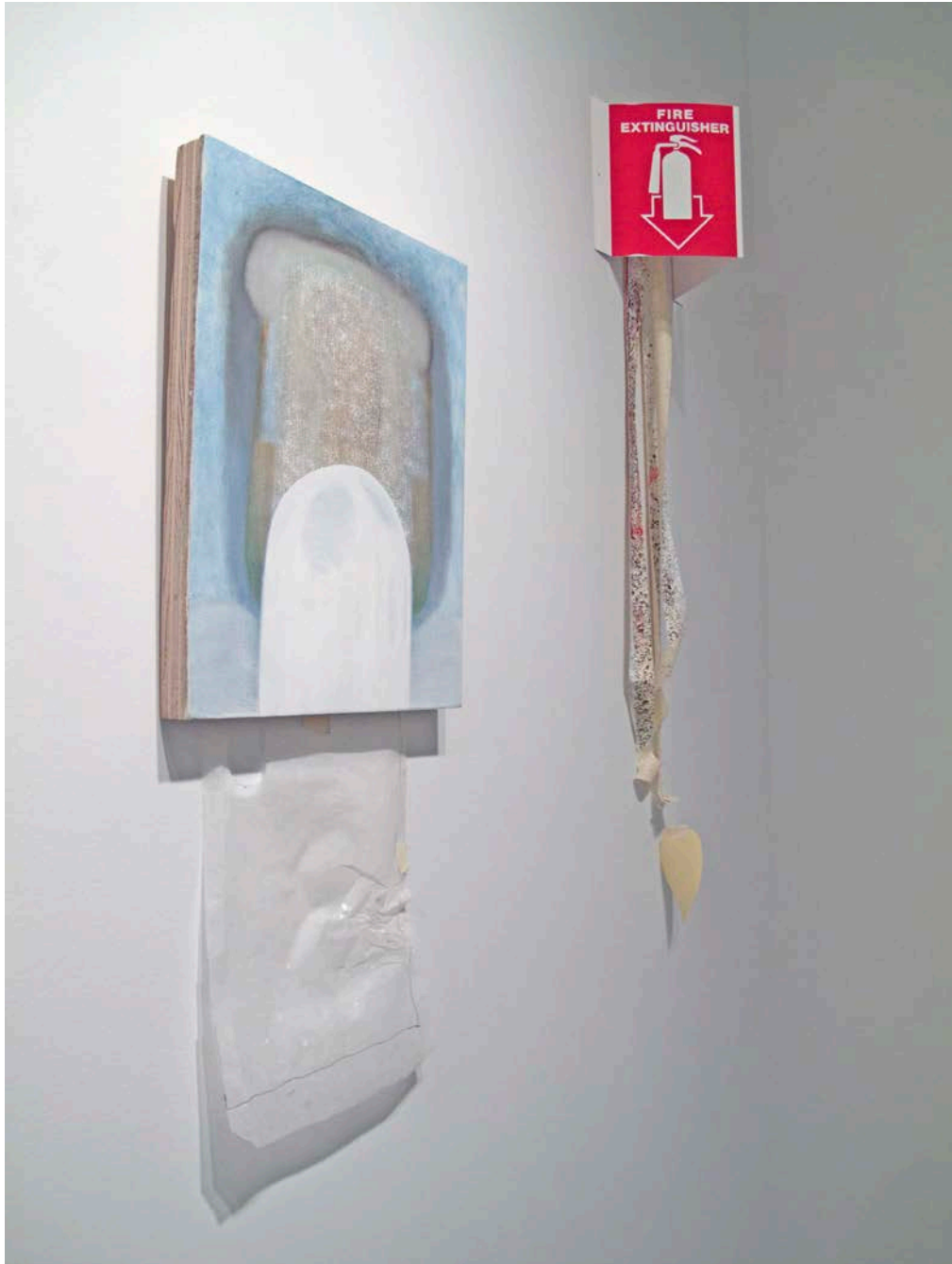
Figure 8. A Body Spectacular (Detail), 2011, mixed media, dimensions variable.

approach attempted to declare that all matter within the space was a part of the conversation.