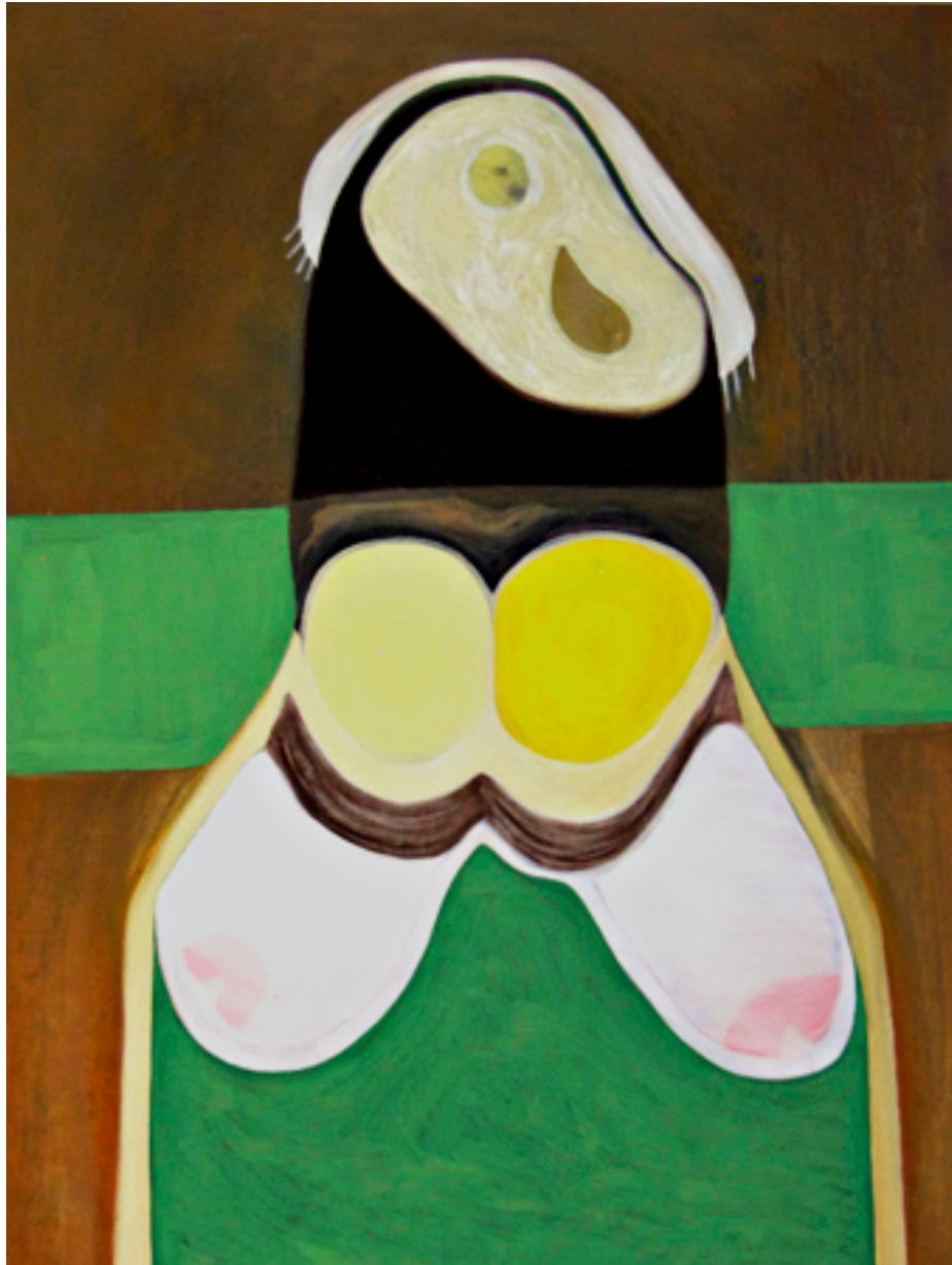
Figure 2. Heavy Hangers , 2010, oil on masonite panel, 48 x 36".

not as the depiction of figure or light, but rather as a tool to reveal the layers of paint existent around and within the figure itself. The scrape marks are large, and come from an obvious physical gesture. Their presence alters the way the rest of the image is interpreted, providing contrast to the controlled glazed surfaces which they surround.