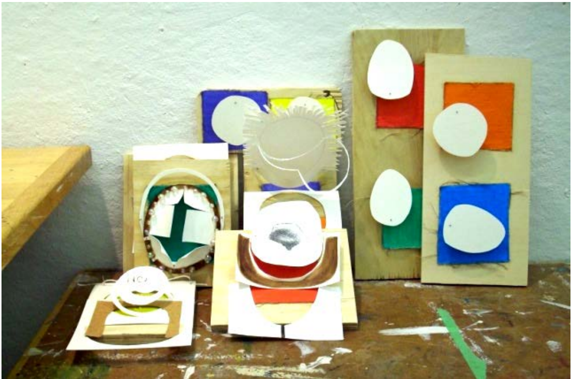
Figure 4. Untitled (Studio Image) , 2009, linen mounted on wood, oil paint, nails, paper, beads, string, ink, pencil crayon. Dimensions variable.

utilized the surrealist system of image making, but also addressed the misogynistic tendencies of the movement. Bourgeois worked through auto-biography, and developed a lexicon of personal imagery that originated from the body. I was also interested in the work of the Winnipeg based art group The Royal Art Lodge (1996-2008), whose collaborative techniques seemed to me to be connected conceptually with the surrealist exquisite corpse methodology. I became particularly interested in the drawing style of the artist Marcel Dzama (one of the R.A.L.'s founding members), for his inventive worlds and playful/disturbing characters.