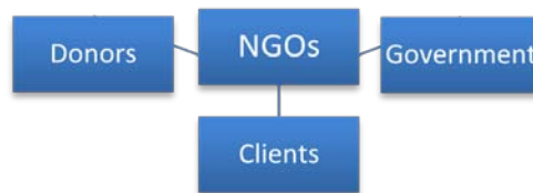
Figure 1: NGO's Primary Stakeholders

NGOs in Africa face a variety of demands placed on them by not just the people they are there to serve (clients), but also donors 3 as well as local governments (see Figure 1). This means that while many of them are there with a specific mission in mind, employees have to be concerned about much more than simply carrying out the NGO's mission. NGOs have to balance the interests of these three critical stakeholders 4 , without allowing this to hinder their mission.