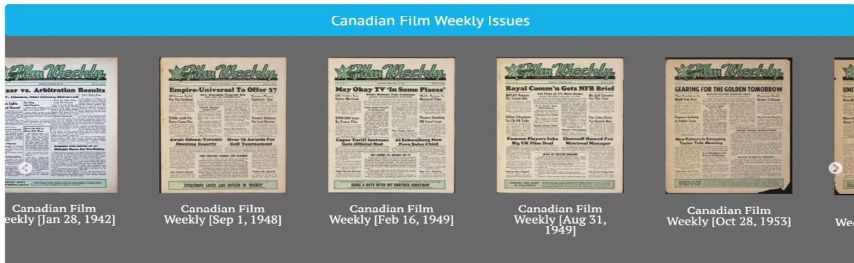
Canada sub-collection in Media History Digital Library mediahist.org/collections/canada