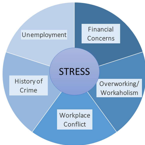
Figure 1. Employment-related stress.