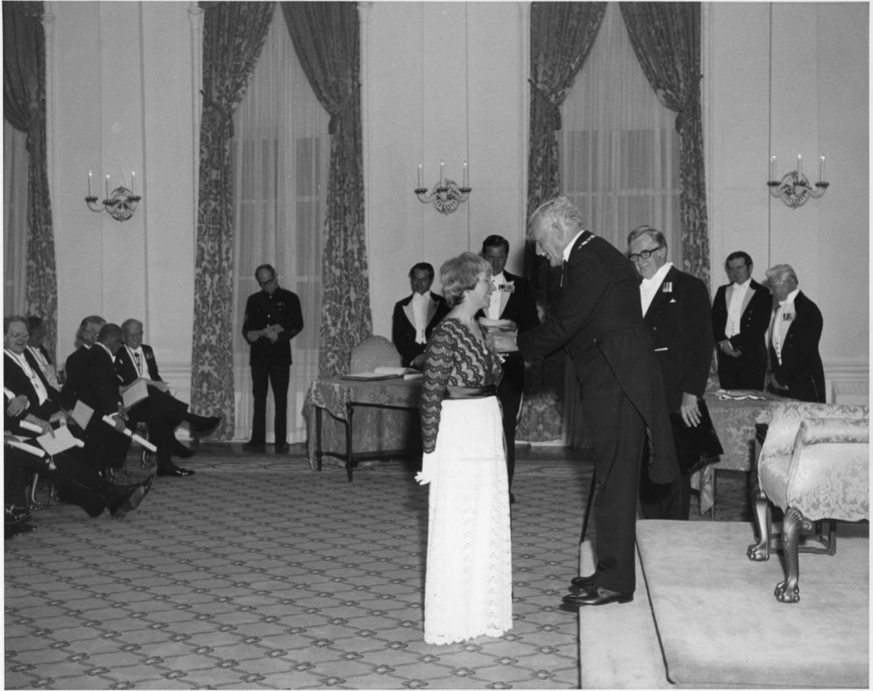
Figure 2: Sister Catherine Wallace receiving the Order of Canada, 1972.