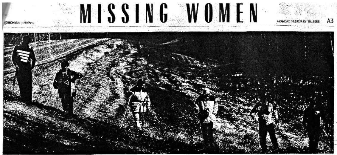
(Kaiser, 2008, p. A3)

more accurately described as part of ‘rural (central) Alberta’, an area outside of the ‘Capital City’. This map, and others like it, operates in much the same way as the other news discourse to both dehumanise and (re)humanise the missing and murdered women of Edmonton’s sex trade (as discussed earlier in this and in the previous chapter). Similarly, the frequent publication of crime scene photographs also places the women (in both death and life) in areas outside of the city proper. As the image below exemplifies, the crime scene images are almost exclusively of barren farmer’s fields, free from any sign of habitation or development, and empty of everyone except crime scene investigators.