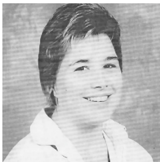
(Supplied B , 2006, p. B7)