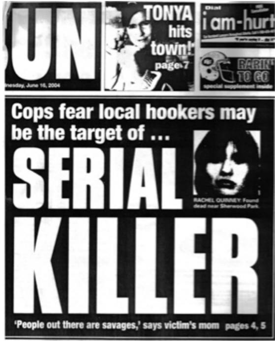
(Uncredited B, 2004, p. 1)