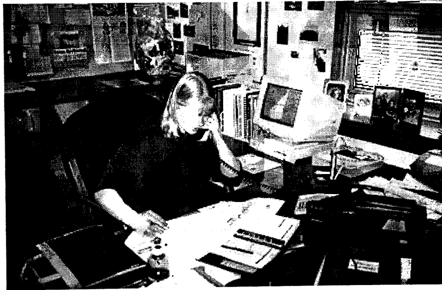
Photograph of Clive School Career Transition student reprinted with permission)