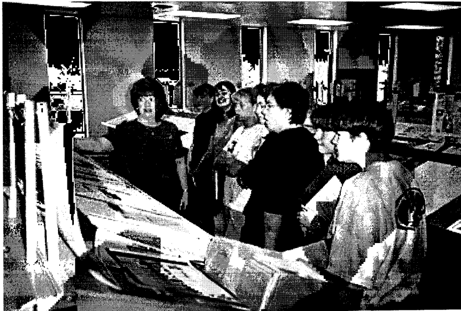
(Photograph of Clive School Career Transition students reprinted with permission)

I believe that Clive School is a leader when it comes to teaching employability skills to its young people. Earlier this year, I surveyed the junior high students and parents to examine, more closely, the issue of teaching employability skills to students. The next section of this report will offer an analysis of these survey results to determine what successes have occurred and suggest recommendations for the future.