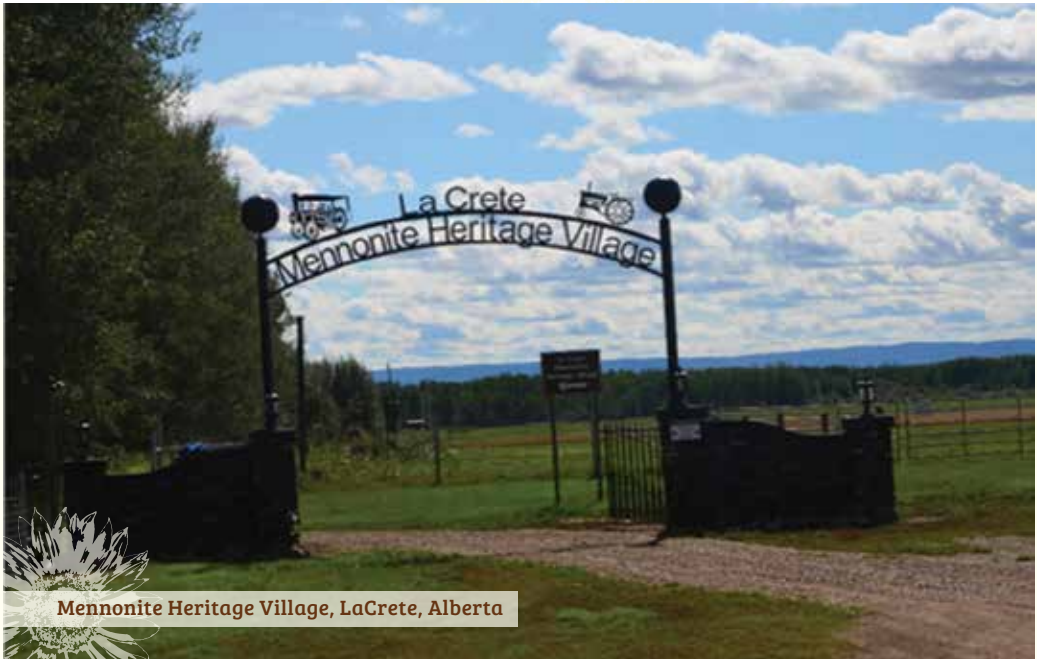
Mennonite Heritage Village, LaCrete, Alberta

Some LG Mennonites are more liberal and take part in mainstream society and use modern conveniences. This group may allow their children to go to school with non-Mennonite children, and do not object to continuing their schooling beyond junior high or high school. In these groups, married, baptized women may decide to no longer wear their kerchief, and they may allow their children to wear other clothing styles beyond the usual home-made simple skirt and blouse. Some of these individuals and families take the risk of being thought of as “too modern” by other members of their community. They may find themselves separated from their fellow LG Mennonites as a result.