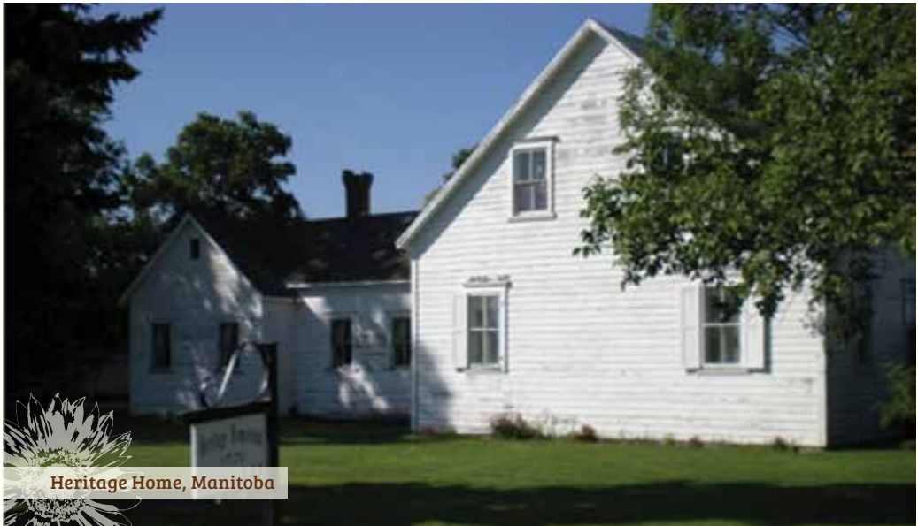
Heritage Home, Manitoba