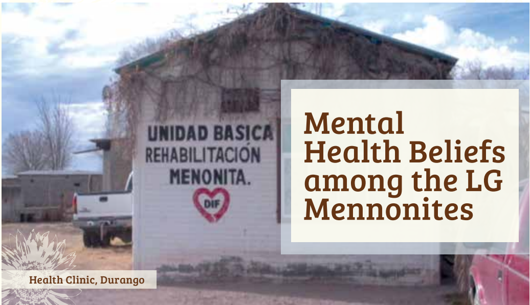
Health Clinic, Durango