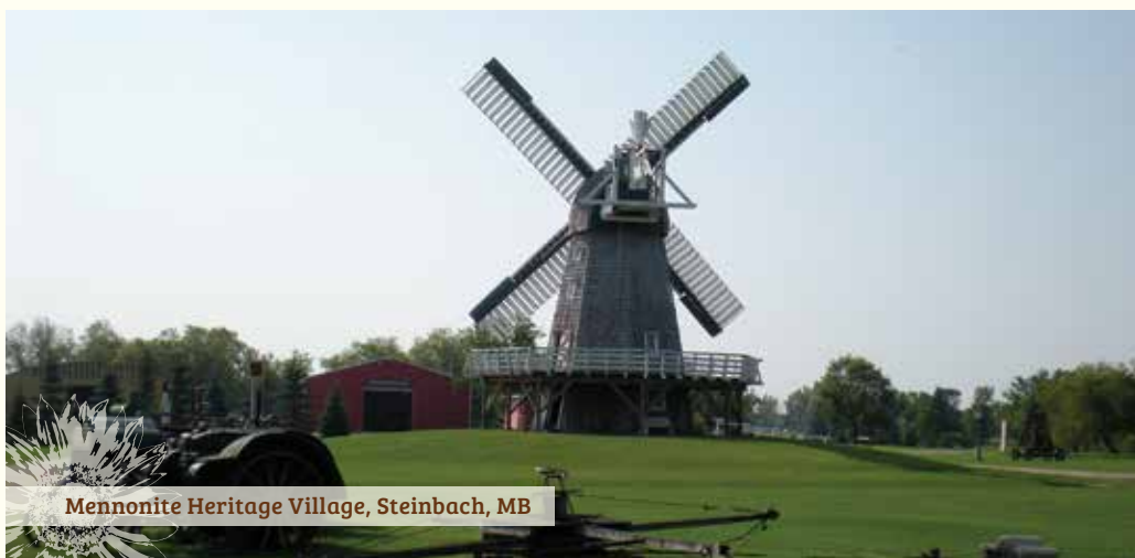
Mennonite Heritage Village, Steinbach, MB

Suicide does occur among the LG Mennonites, in southern locales as well as in Canada. Some ministers interpret this action as sinful and a sure sign that the individual will be eternally damned. The family of the individual who has died by suicide needs support and reassurance, particularly if the individual has been buried differently due to the suicide—outside of the graveyard, for example. While this occurs infrequently in Canada it is more common in Mexico. Hence, individuals who arrive in Canada may be dealing with a variety of issues from their past that negatively impact their everyday health.