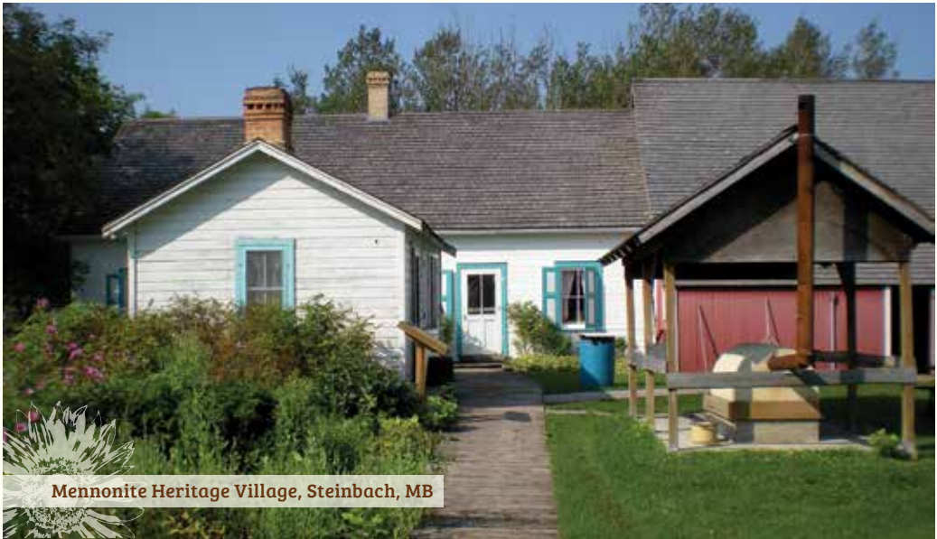
Mennonite Heritage Village, Steinbach, MB