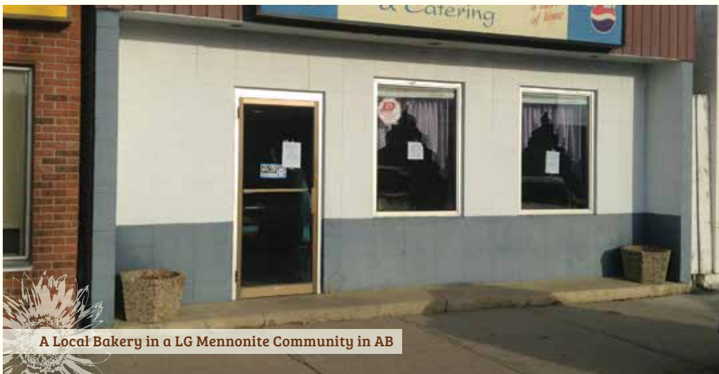
A Local Bakery in a LG Mennonite Community in AB

communities may display varying degrees of hesitation to contact health and social service providers. For those who are more conservative, their children are usually home schooled within a Christian curriculum because there are concerns about mingling with non-Mennonite and non-Christian groups, as well as about children being exposed to a curriculum that includes topics such as human sexuality or the scientific explanation for the creation of the world. However, those LG Mennonites who move to Canada from southern locales have a limited education, and thus are not well prepared to assist their children succeed in the home schooling process. In some areas of southern Alberta, special education programs have been developed to assist the LG Mennonite children succeed academically. For example, the Burdett school in southern Alberta offers German language and Mennonite culture/religion classes to their LG Mennonite students, who constitute about 90% of the student population.