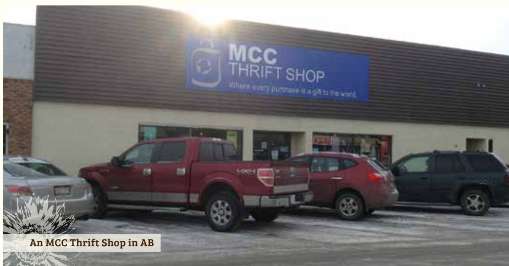
An MCC Thrift Shop in AB