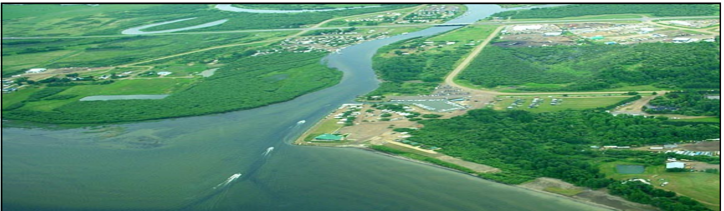
Lesser Slave Lake outlet into Lesser Slave River

This document is based upon the interviews and community fieldwork completed in the Slave Lake region in the first year after the wildfires. The purpose is to share the lessons learned related to the recovery of the community and its citizens. Findings from the school and household survey are available in other reports; see ruralwildfire.ca .