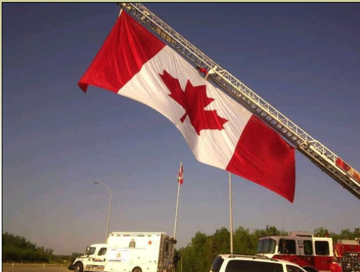
Evacuees returning home May 27, 2011