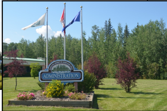
MD of Lesser Slave River No. 124