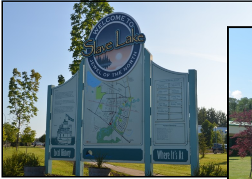
Town of Slave Lake