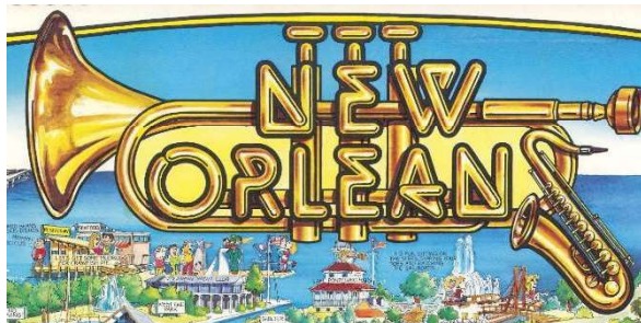
Figure 1: Detail of title of New Orleans (1983) poster-map.