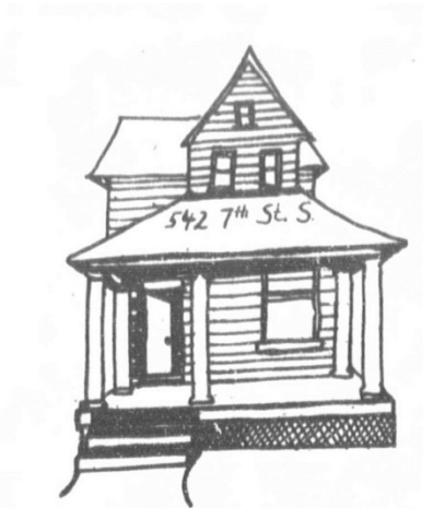
Figure 1: LBCIC Logo, from the Meliorist.