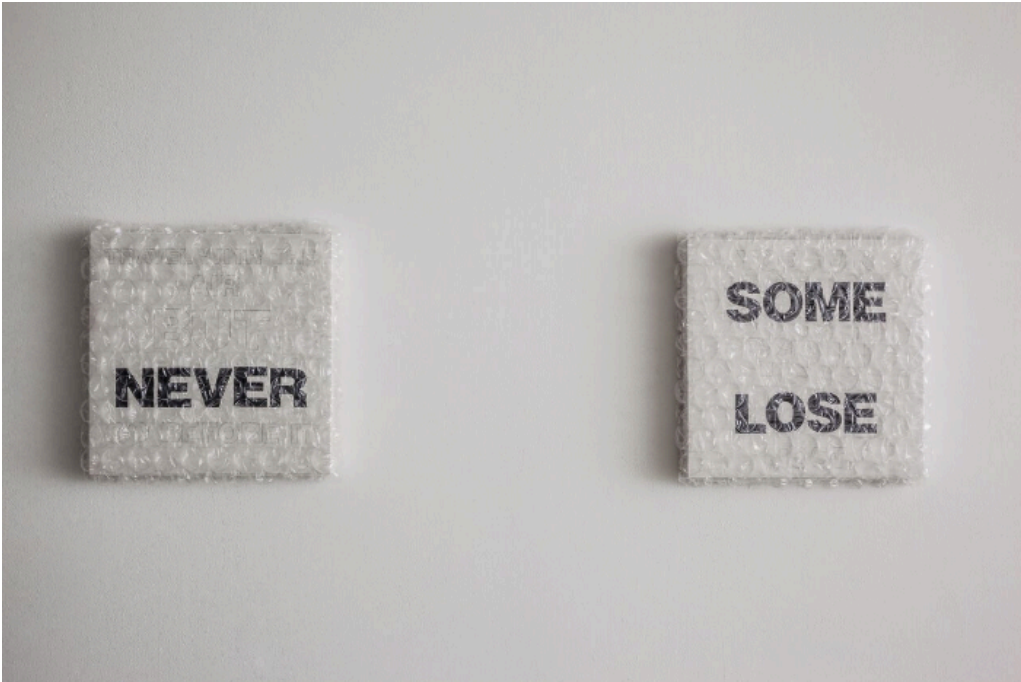
Image 11: Detail of Never and Some Lose from the series I'm still unpacking these thoughts...