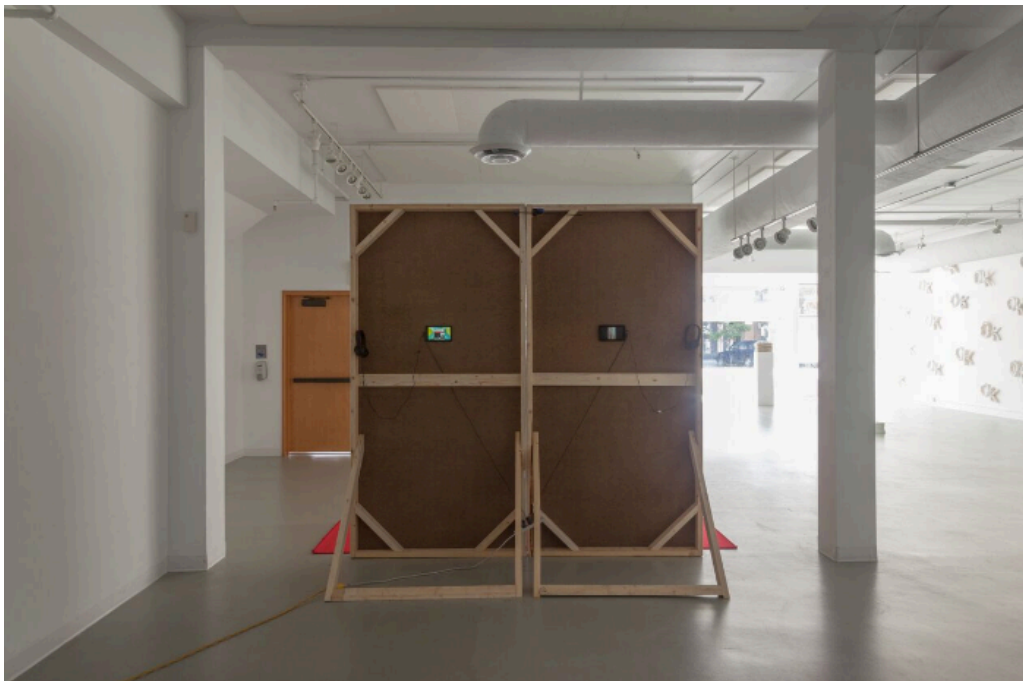
Image 6: Installation shot of Seven Strategies for Happiness and Pedicure as a cure for what socially ails you