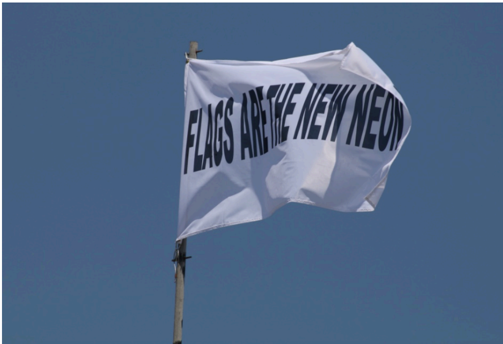
Image 15: Flags are the New Neon (Thankfully flags are affordable)