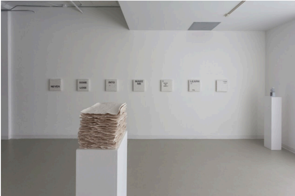
Image 9: Installation shot of I'm still unpacking these thoughts... (Painting series)