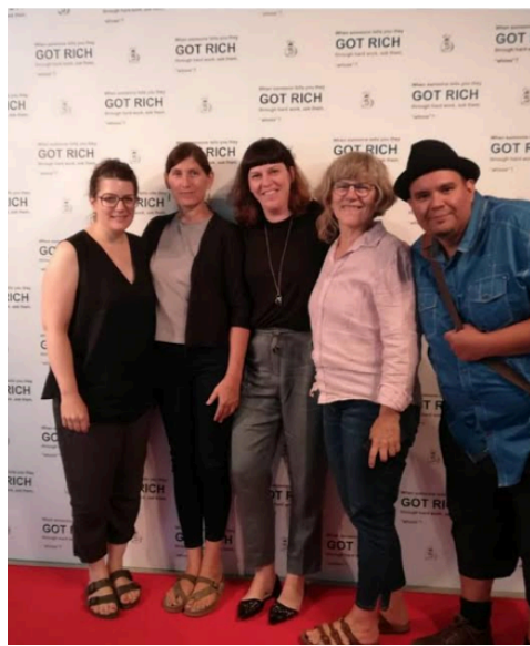
Image 16: Activation of Step and Repeat at Closing Reception.