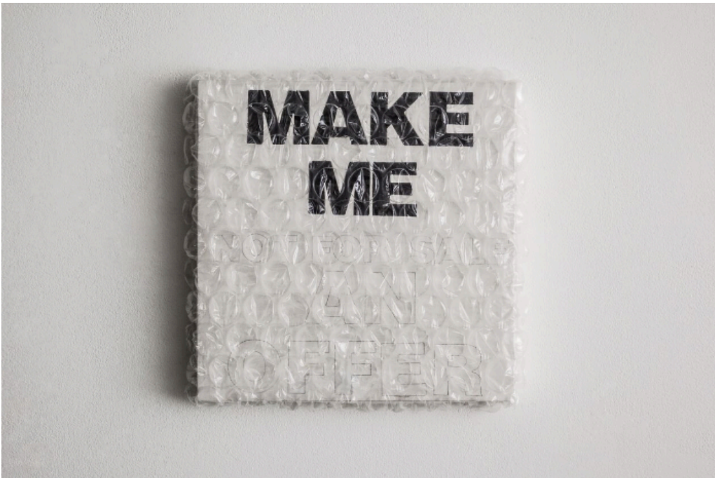
Image 12: Detail of Make Me from the series I'm still unpacking these thoughts...