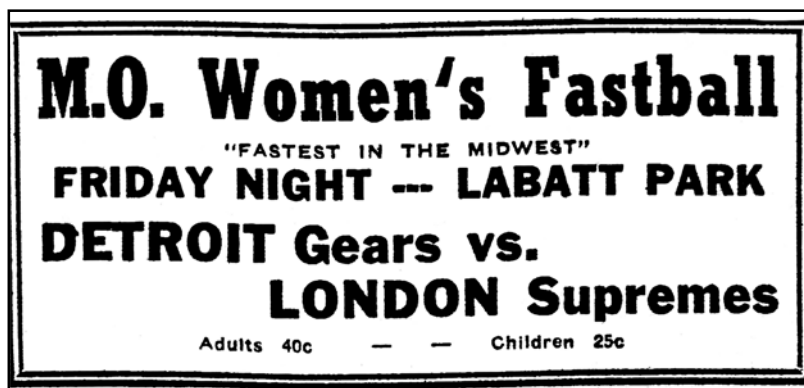
Detroit Gears vs London Supremes game advertisement, Michigan-Ontario Women's Fastball League, London (Ont.) Free Press , 10 July 1947, p. 34.