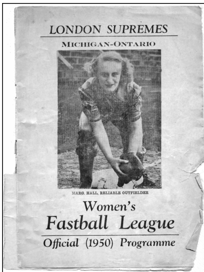
London Supremes Program, 1950.