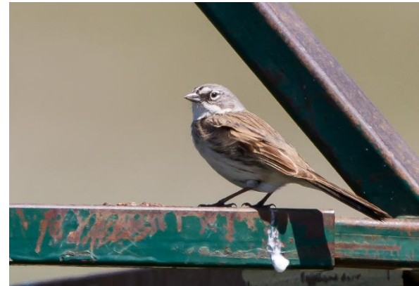
SAGEBRUSH SPARROW, CYPRESS COUNTY CONNOR CHARCHUK

Cottrell), reported on eBird ( S54011892 ). CODE 1 RECORD. Trochu; 15 June 2019; 2 images (Michelle Houston). CODE 1 RECORD.