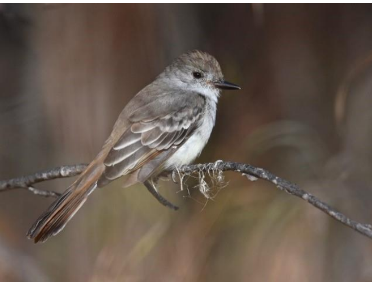
ASH-THROATED FLYCATCHER, ST. ALBERT LUDO BOGAERT

Red-bellied Woodpecker ( Melanerpes carolinus ): SE of Bragg Creek from late July to mid-September 2015; written report with 2 images (James and Gerry Fox); 2 images (Ray Wershler). CODE 1 RECORD. Near Priddis from mid-October 2015 to