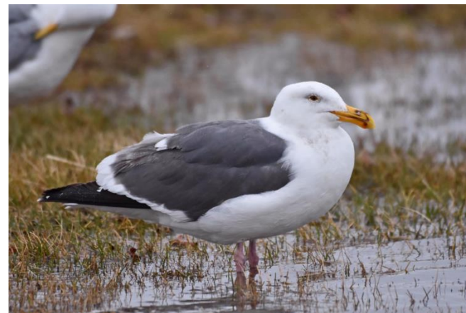
WESTERN GULL, COUNTY OF GRANDE PRAIRIE SYLVAIN BOURDAGES

Little Blue Heron ( Egretta caerulea ): Medicine Lake, N of Rocky Mountain House; 2 Oct 2015; several images on Albertabird and a video (Don Auten). CODE 1 RECORD.