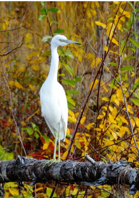
LITTLE BLUE HERON, CLEARWATER COUNTY DON AUTEN

Lucas); several other images on eBird. CODE 1 RECORD.