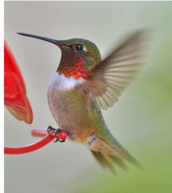
BROAD-TAILED HUMMINGBIRD, BEAVER MINES GORDON PETERSEN

Ash-throated Flycatcher ( Myiarchus cinerascens ): Big Lake, St. Albert; from 9 October 2019 for at least a week; may have been present as early as 13 September 2019; 3 images (Rose McAllister), several images posted on eBird, also reported in St. Albert Gazette at