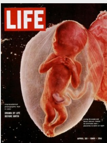
Figure 3 Lennart Nilsson cover Life Magazine 30 April 1965 accessed 27 Oct 2014

How precisely does the GAP use of specific photographs reproduce socially conservative or morally judgemental ideology? Visual culture theorist Susan Sontag described the ideological “work” performed by depictions of “atrocities” as giving “rise to opposing responses. A call for peace. A cry for revenge” (Sontag 2003, 13). Without question, the GAP purposefully shocks and distresses; with a larger aim being to conceptually erode “liberal” visions of reproductive autonomy and to resurrect oppositions between a woman’s rights and those of the fetus. This proposition, as above in the CCBR justification for graphic imagery, conceives women as potentially threatening to their fetuses. In the GAP displays, the fetus, detached from the pregnant body or uterus, is representationally isolated—autonomous and free floating—whereas the pregnant woman is entirely absent (Petchesky). This visual construction rationalizes the appropriation of “civil rights” rhetoric. The implication is the fetus is autonomous yet vulnerable and needy of protection by non-maternal guardianship, in other words by other, state configurations of power and control.