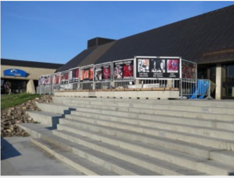
Figure 1 Genocide Awareness Project, University of Lethbridge. October 2014.

of Rights and Freedoms, litigation was adopted by “interest groups” because political leadership tends to avoid decisive action on “morally sensitive issues.” The courts’ importance has therefore risen in tandem with political preference towards “judicial mediation” regarding “moral disputes” (Snow 2014, 154; 160). As Petchesky observed in 1987, the “anti-abortion movement made a conscious strategic shift from religious discourse and authorities to medicotechnical ones [to conceptually