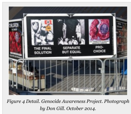
Figure 4 Detail. Genocide Awareness Project. October 2014.