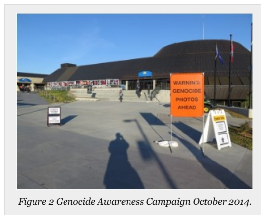
Figure 2 Genocide Awareness Campaign October 2014.

With intention to shock these images guarantee a reaction. Recently, the CCBR has extended their shock tactics beyond campus by direct marketing doorknob flyers to households where the graphics are unavoidable. Claimed to be "the backbone of CBR's various public, abortion-education projects, GAP postcards, pamphlets, and stills of "bloodied flesh and body parts" are recommended as educational resources for classroom and lesson plans . The