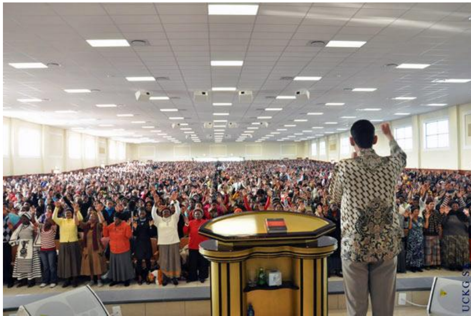
Figure 6: Grand Opening of the new UCKG church in Khayelitsha, South Africa.

it is now sending black, English-speaking South Africans as missionary ministers throughout sub-Saharan Africa and to England, the United States, and the Caribbean. 411