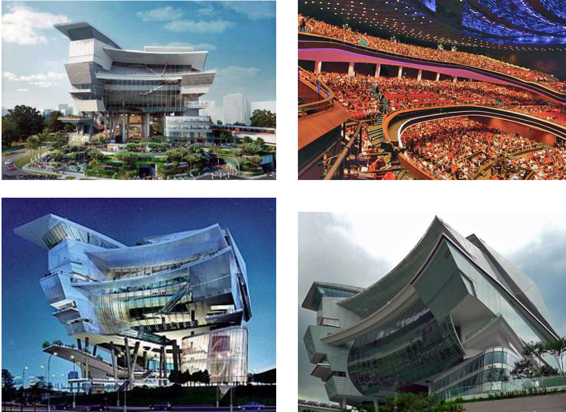
Figure 14: New Creation Church, Singapore.

These churches and their members do not measure up to Martin's stereotypical Pentecostal on several counts. The members are for the most part affluent, well educated, and belong to the dominant ethnic group of the country. They are also from families who have lived in Singapore for several generations, and they are in no way part of a migrant community. In no sense of the word could they be portrayed as marginalized, as was the case described earlier with the socially marginalized, but wealthy, ethnic Chinese community in neighbouring Malaysia and Indonesia. Why then have such large numbers of this non-marginalized community turned to a prosperity gospel-centric brand of Pentecostalism? For a possible answer to this question, it is most helpful to turn to an intriguing line of thought proposed by Gerard Jacobs.