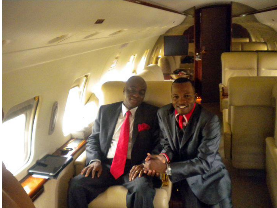
Figure 13: David Oyedepo, left, relaxing on one of his five corporate jets.