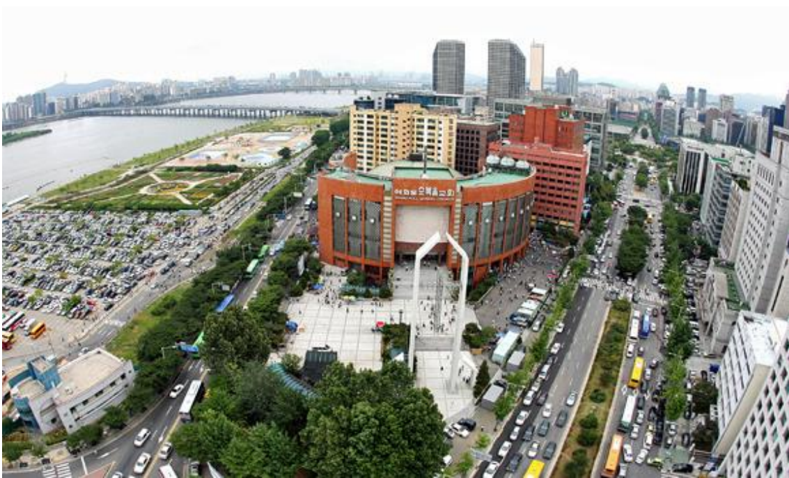
Figure 3: The Yoido Full Gospel Church, Seoul, Korea.

hundred thousand member mark, complete with seven hundred pastors, all under the direction of Cho. 153 Clearly it had become the largest church in the world, a fact recognized by the Guinness Book of World Records in 2005. 154 More significantly for the Pentecostal movement, Cho's cell group concept was widely emulated, particularly its emphasis on the use of female worshippers as lay leaders.