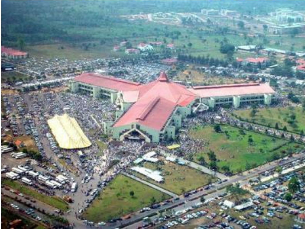
Figure 12: The world's largest church building, Faith Tabernacle, Canaanland, Nigeria.

Winners' Chapel in Lagos is filled to its capacity of fifty thousand for four separate services each and every Sunday, and the denomination now has five thousand churches in Nigeria and another six hundred around the world. 616