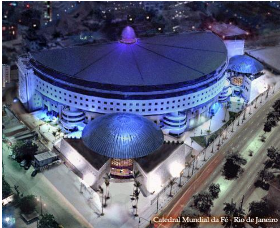
Figure 5: Catedral Mundial da Fé-Rio de Janeiro.