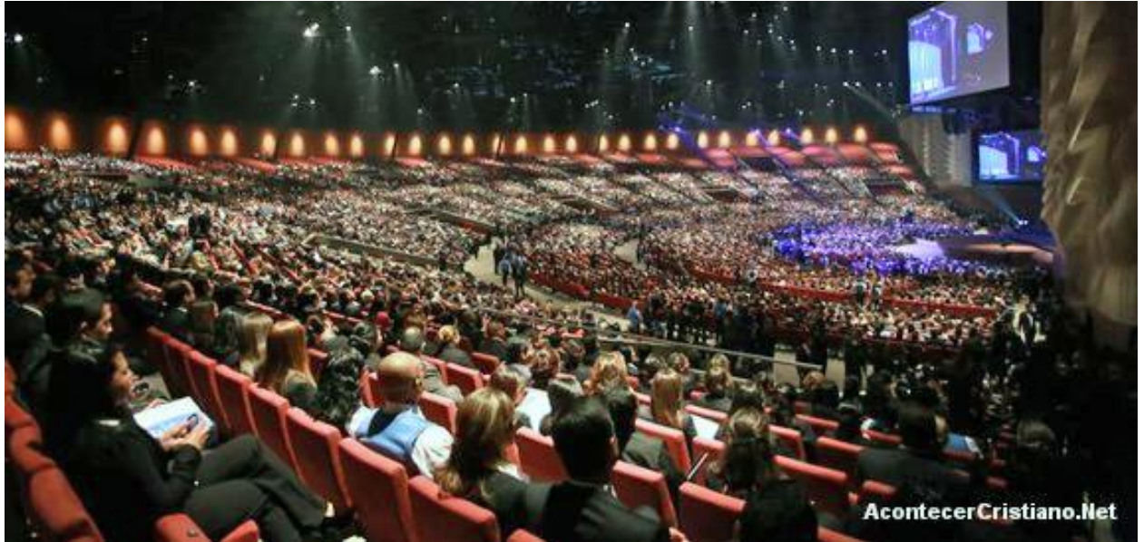
Figure 8: Casa de Dios-Guatemala City. The new megachurch of Cash Luna.

anthems and hymns that stoked both Pentecostal and patriotic fervor. 460 As both Calballeros and Luna have demonstrated, dynamic Pentecostal growth and the prosperity gospel are thriving in Guatemala.