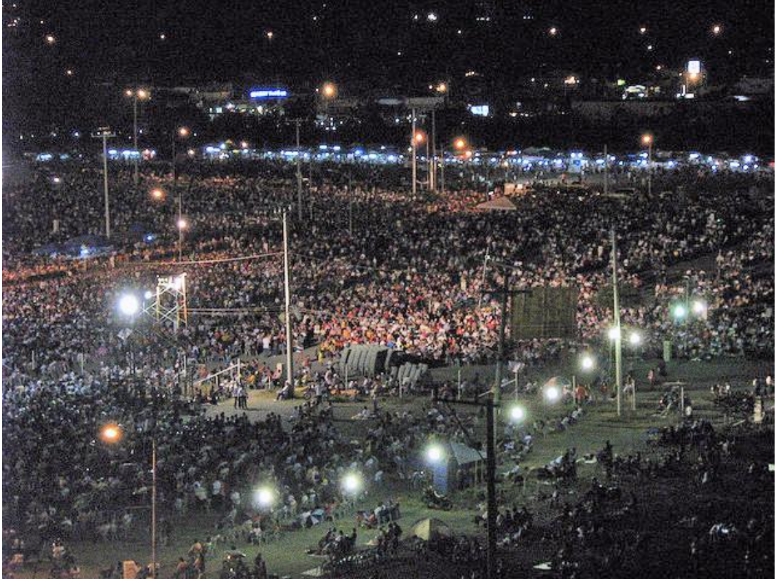
Figure 4: El Shaddai evening rally, Manila.