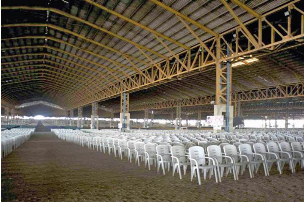
Figure 10: Redemption Camp, Nigeria, 2013.