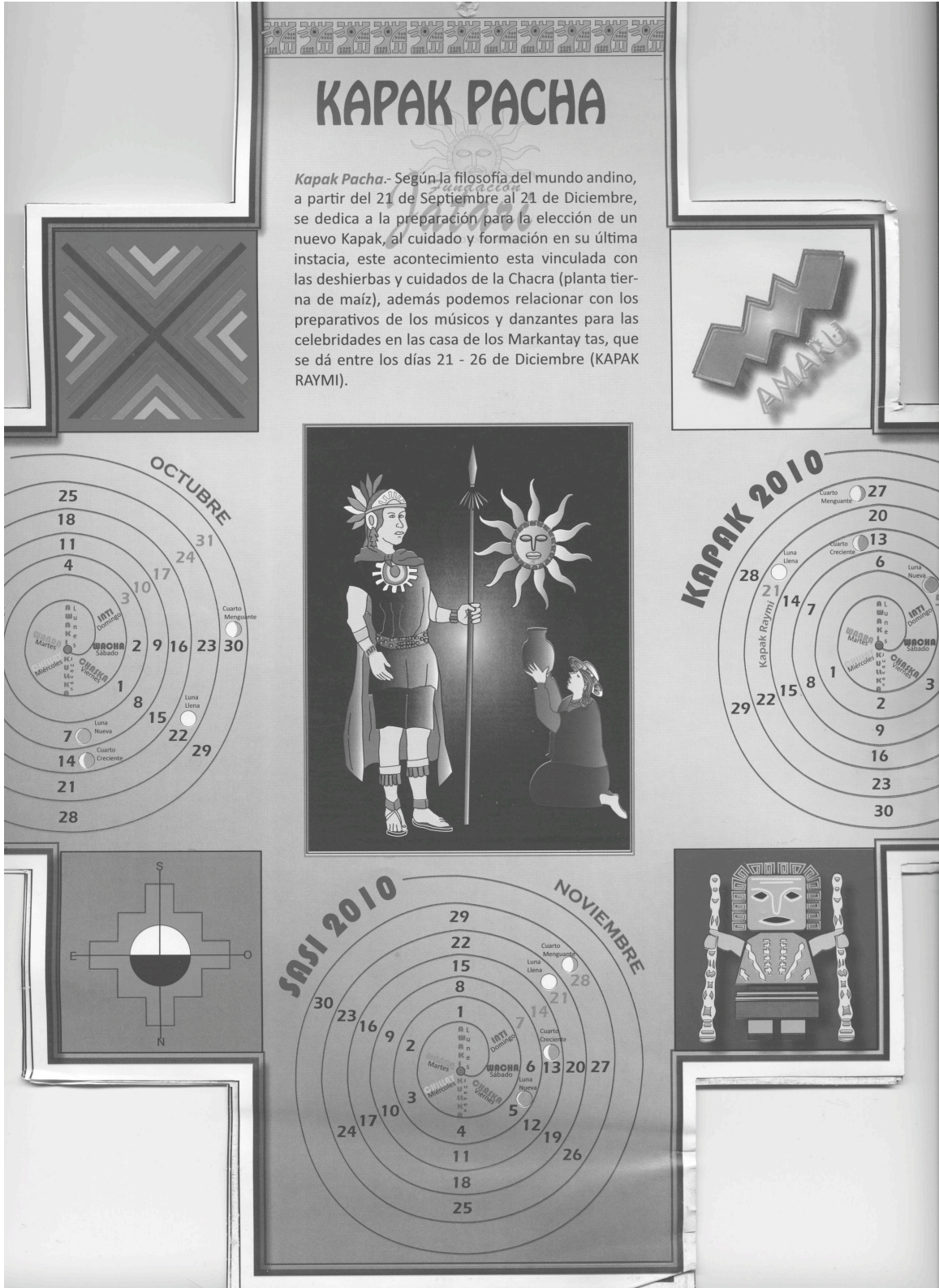
Figure 14: A calendar distributed by the Jatari Foundation presents Andean and Inkaic imagery.