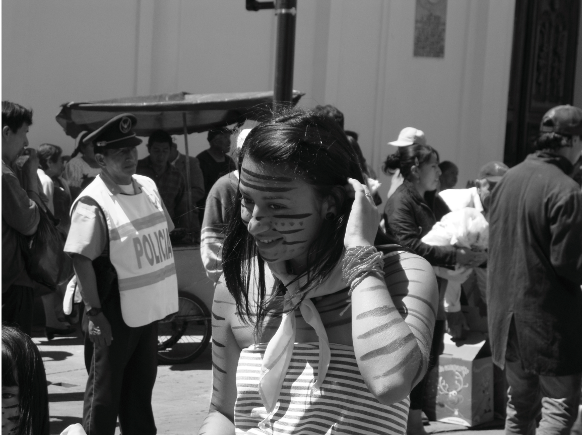
Figure 9: Participating in the Pase del Niño parade, a young woman is costumed as an “Indian.”

The Pase del Niño Viajero (Passage of the Traveling Child) is another example of this process. This parade is held yearly on the 24th of December in Cuenca, commemorating both the birth of Jesus, as well as the passage of a figure of Christ through Ecuador. Leading the procession through the streets packed with tourists and citizens alike is the archangel, followed on horseback by Mary and Joseph with their newborn and surrounded by costumed wise men. Neighborhood bands thump out rhythms for school dancers who twirl around maypoles, while beauty queens sit on their floats, waving to the crowds. Indians are present as well, but these are largely portrayals of indigeneity incorporated into the national society: white Cuencanos dressed as exotic Shuars or Huaorani from the Amazonian basin, complete with painted faces and