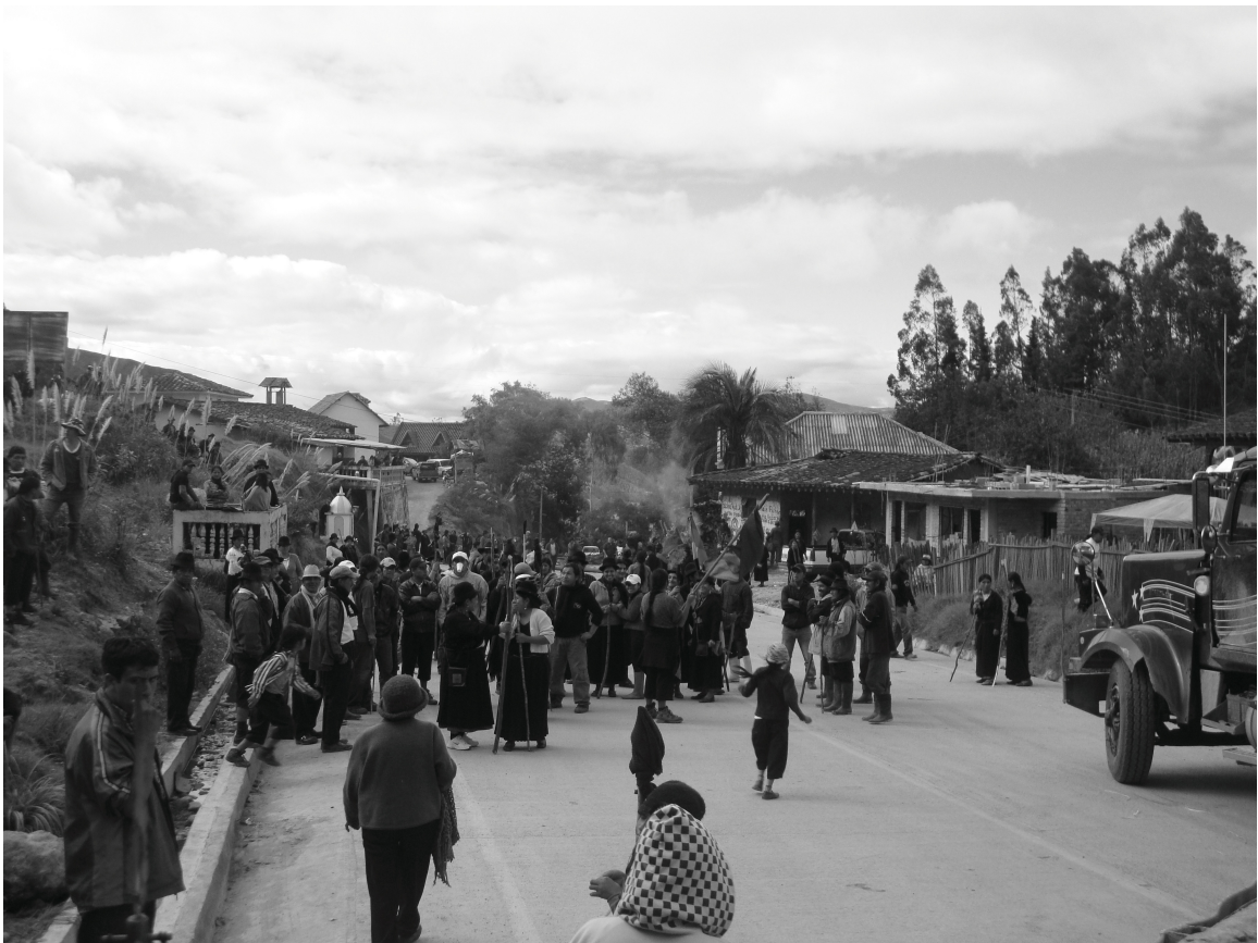
Figure 10: The paro at San Vicente.

(Selverston 1994; Zamosc 1994). It has also played a large role in organizing the not infrequent strikes, roadblocks, and indigenous uprisings. The most famous of these strikes was the 1990 Levantamiento (uprising), when highland indigenous groups across Ecuador organized to block roads, occupy churches, march on government buildings, and stop production in general strikes to lobby against failed land reforms that continued to deprive indigenous peoples of adequate land. What makes such large scale organizing possible is a scaling up of community level participation, with each community or lower level organization agreeing to support the movement as a whole. Such ad-hoc organization from local cabildo councils and indigenous communities themselves, taken collectively, amount to national protests (Zamosc 1994).