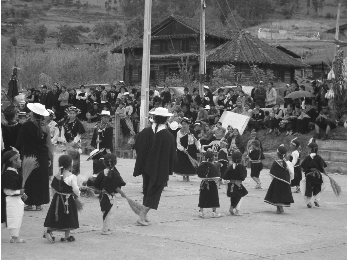
Figure 15: Neo-Inkas lead school children in a ceremonial dance during Inti Raymi 2010.

The Inti Raymi festivities put on display the Hyperreal Indian for all to see. Those inconsistencies, the messiness of reality and the dirt of poverty and all the conflicting moral choices that characterize the lives of the majority of those who call themselves Saraguro, and that Ramos' Brazilian NGOs saw as contaminating the people who they were supposed to represent, are absent in this yearly festival of the sun. Instead, the Indians on display are cleansed (quite literally, as there is a ritual cleansing as part of the ceremony) to make a show - not of who Saraguros necessarily are - of who Saraguros could, and should be. The choclos forming the starburst are locally grown and strongly symbolic of a local identity as peasant farmers, a lifestyle that has had to be largely left behind as these self-proclaimed shamans have become intellectuals and professionals, but