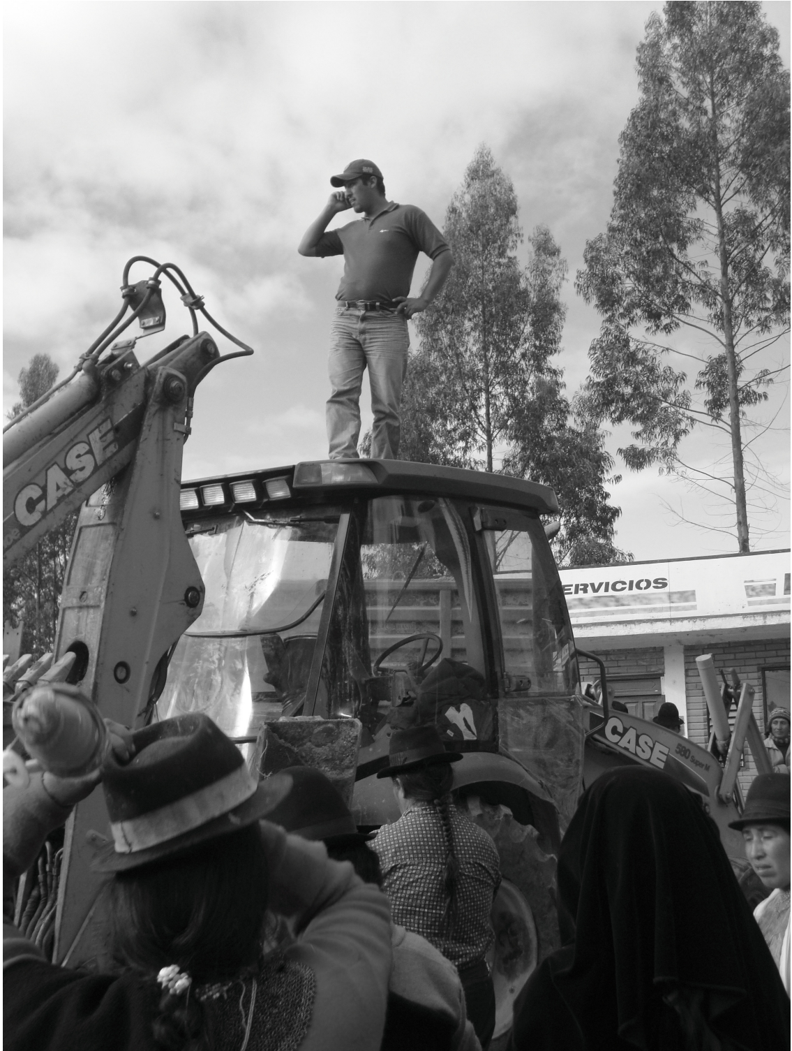
Figure 12: A municipal employee is stranded on his tractor by protesters.

era elección del pueblo. (They, the machine operators, aren't to blame. The protesters left it up to them, to fulfill a sanction/obligation on behalf of the people.)