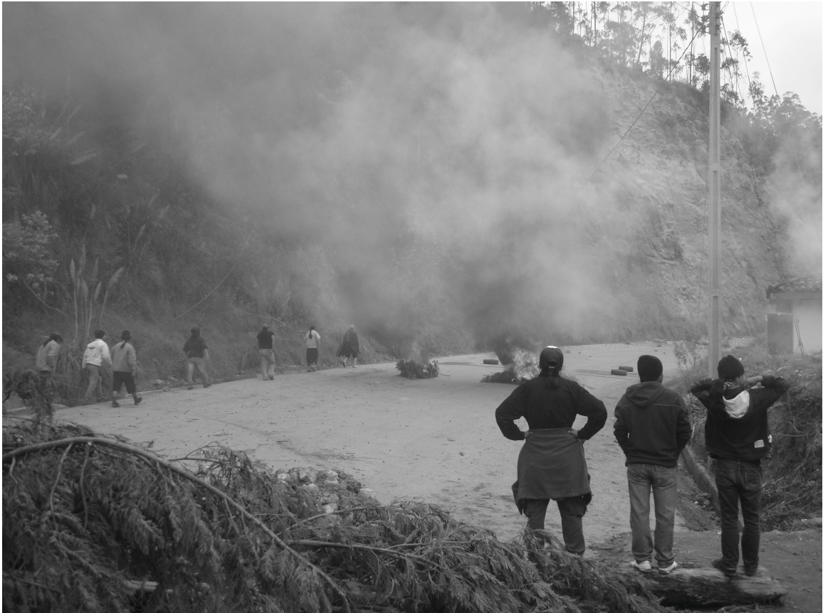
Figure 11: Protesters prepare for the arrival of the police at the Ñamarín roadblock.

blockade, drinking, and watching a group of youth push boulders off the high cliff overlooking the road, laughing as the stones touched the electrical wires and sent sparks flying.