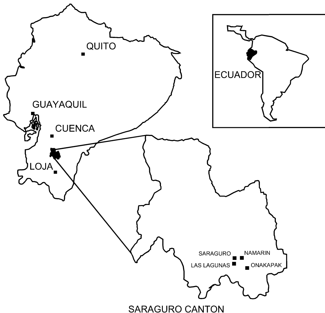
Figure 1: Map of Saraguro, Ecuador. Map by Brett Freeman.

meters, and the peak of Tayta Pulla, the mountain that dominates the panorama around Saraguro, tops out at just under 3400 meters. Land used for agriculture is not restricted by elevation, though most land above 2800 meters is largely pasture. The climate is temperate, with warm days alternating with very cool nights, though frost is rare. Most of the region has adequate rainfall throughout the year, but the eastern part of the canton is drier than other areas.