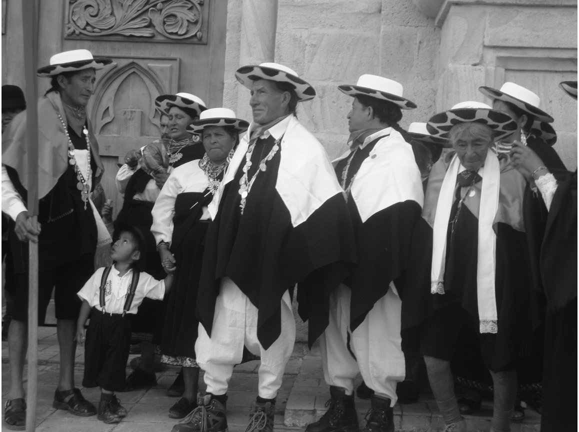
Figure 16: Fiesta sponsors stand outside of the church in Saraguro during Easter.

The Holy Week celebrations, like the other festive occasions throughout the year, combine community-wide feasting with Catholic worship that is more closely associated with the Church itself. Indigenous Catholic practices do not, however, always align perfectly with more mainstream interpretations of Christian faith or dogma, having for centuries combined elements of European and Andean spirituality. God, the death and resurrection of Christ, and the Virgin Mary are brought to the center of worship on this occasion, but the mountain deities, local waterfalls said to be manifestations of the Virgin, and the Pachamama/Earth Mother are also respected and celebrated in other ways, sometimes as simply as pouring out a bit of trago. Celebrations such as Holy Week, then,