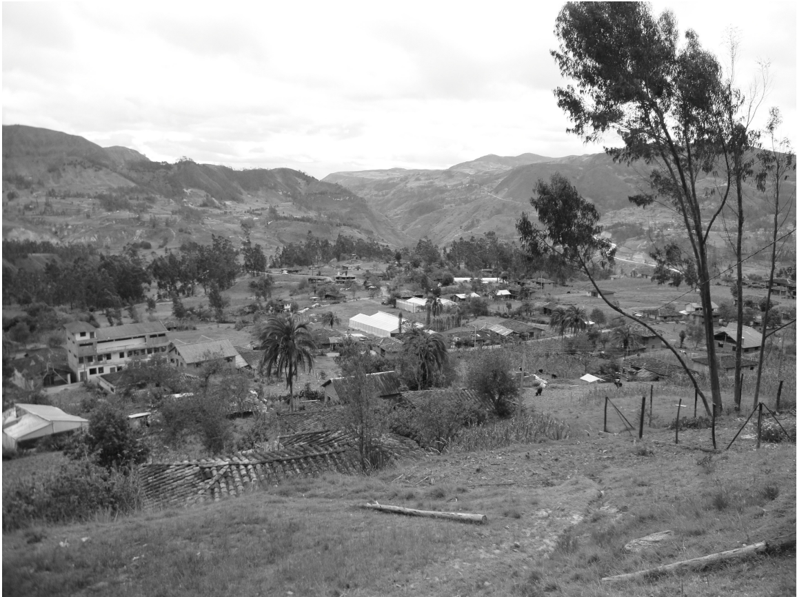
Figure 5: The Community of Ñamarín.

Ñamarín is a relatively small community compared to Oñakapak or Lagunas, with about 75 active households. Most of the houses are nucleated around the center of the ridge on which the community sits, but others are scattered along the highway or on the steeper forested incline leading up to the high pasturelands. Each house generally has a small amount of arable land immediately adjacent to it, but a household's total land will likely be spread between different elevations and areas. The houses themselves are varied and tell of a diversity in wealth. Older U-shaped adobe houses, with small or no windows and coloured by years of cooking fires are maintained alongside newer breeze block cement structures or brick houses with large, tinted windows. Strangely enough, a handful of the new, larger houses sit empty, their financiers living and working in Spain