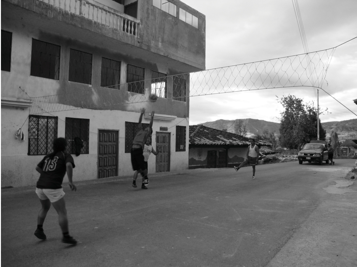
Figure 6: Men play volleyball outside of the casa comunal .

The type of volleyball enjoyed in large parts of Ecuador (usually called Ecuavoley, or more commonly in Saraguro, boley) is played with a heavier ball than in North America, usually a soccer ball; teams are composed of three rather than six players, and the net is generally high so that “spiking” is not feasible or allowed. These features combine to make the game one of technique, positioning, and teamwork. Rectangular courts do not divide easily into three, meaning that each team member has to move to cover areas opened up by the movement of another, and a lack of coordination leads to more points scored against than anything else. In Ñamarín, as elsewhere in Saraguro, boley is a man’s game - women and most youth are more likely to play soccer - and in Ñamarín the core group of players are middle aged men with established households and