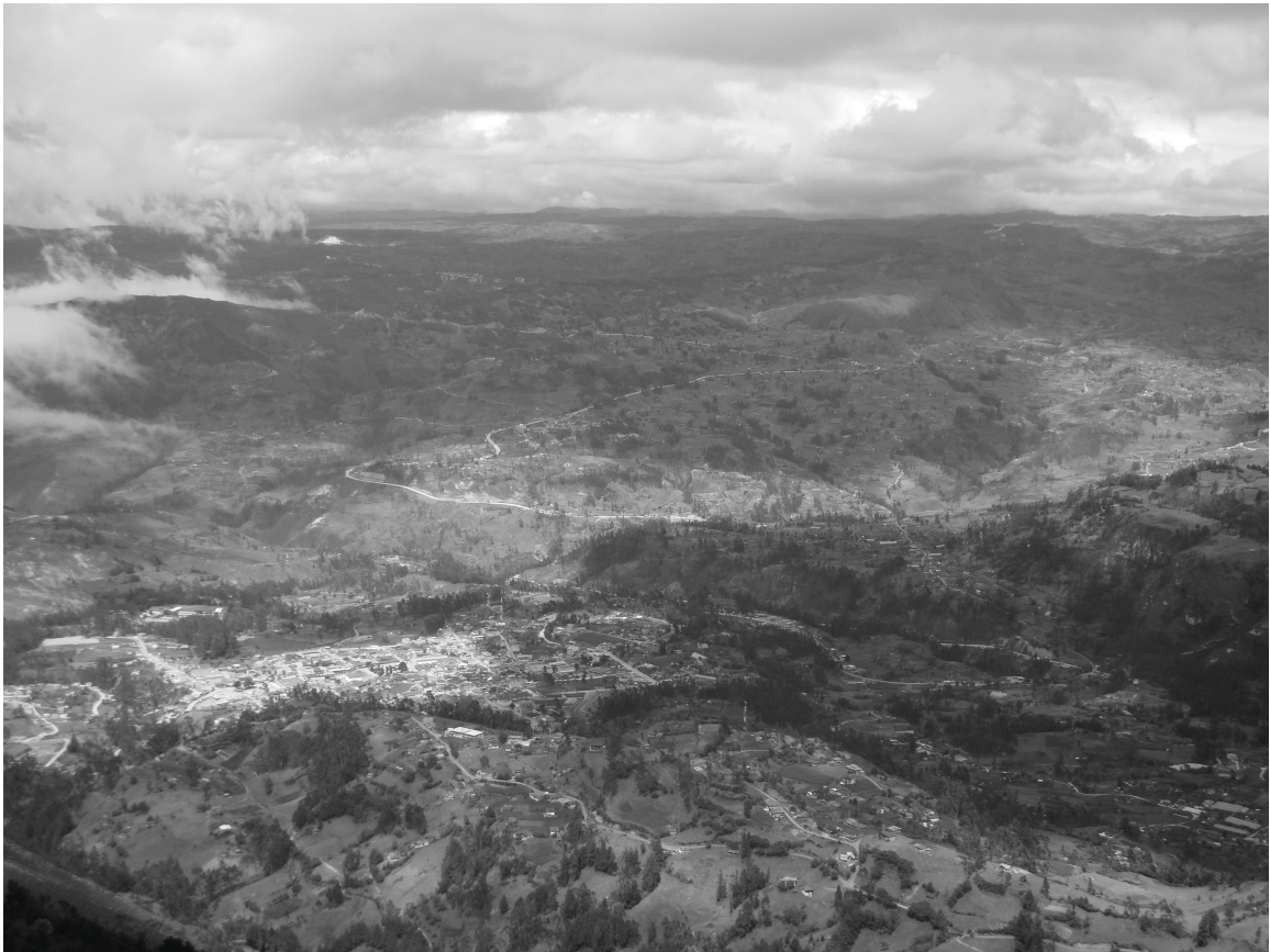
Figure 2: Overlooking the Saraguro Valley.

(see Colloredo-Mansfeld 1999; 2009 for similar cases in Otavalo and Tigua, respectively).