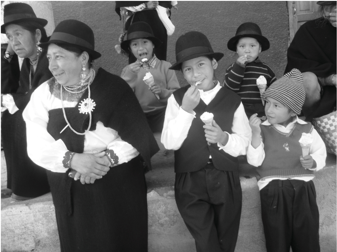
Figure 3: Saraguro women with their children on Easter Sunday.

way as to diminish the bulge of fabric around the waist, or foregoing the pollera altogether allow young women to make a certain compromise in taste when they wear the more traditional garb. For festive occasions such as graduations, women might complement their outfit with fashionable heels. It is quite a sight to see whole families dressed in their best in this way, and mothers worry about making sure their absent minded young son hasn't misplaced his hat, or that their daughter's anaku is ironed just right to tighten and even out the folds.