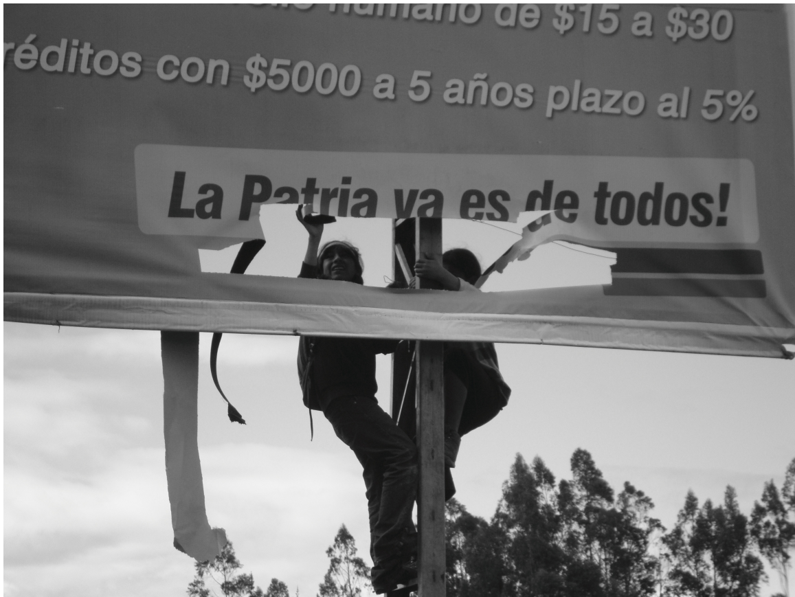
Figure 13: Two youth destroy a billboard.

But just as these groups and communities seemingly acknowledge the existence and authority of the state, they negotiate their place within it. The nation state, as elaborated by James Scott (1998), governs by reducing the complexity of human society, thereby making it legible, visible, and controllable. While many subaltern movements and groups may not inherently question the existence of the state, they often attempt to disguise or occlude certain realms of activity in order to maintain spaces of autonomy which governmental interventions are unable to penetrate. In Saraguro, as Luis Macas suggested, acquiescence was one strategy by which Saraguros could maintain their landbase and their culture by portraying themselves as subservient, and thereby countering any claims that direct governmental intervention was necessary. Part of this