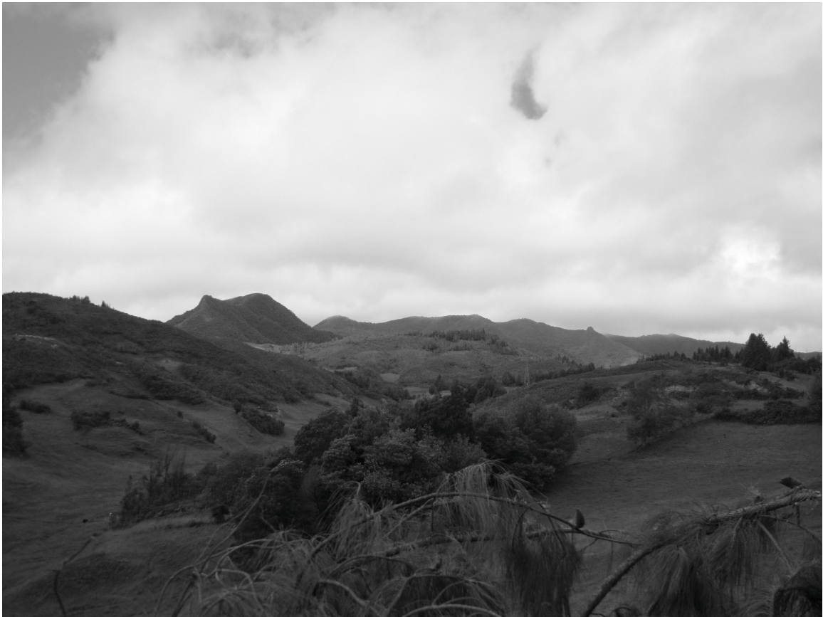
Figure 8: The páramo of Ñamarín, looking South towards Uritusinka.

increasing mestizaje and outmigration has led, eventually, to the decline and even death of the previously “indigenous” community. Though Trawick could be criticized for pursuing “lo Andino” (the essentialist view of traditional, timeless Andean indigenous practices), many comuneros in Saraguro also believe that declining minga participation, youth who do not wish to farm or herd, and increased mestizaje is leading not only to a change in what it means for them to be indigenous, but also to a decline in the community itself.