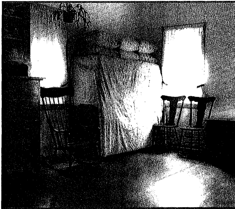
A typical living room in any of the dozens of Mennonite colonies in Mexico today.

shaving an area on the woman's head, the husband should be involved in providing permission. The same person also stated that most Mexican Mennonites would prefer to be discharged from hospital as soon as possible. Community members care for the ill person by providing food and doing housework.