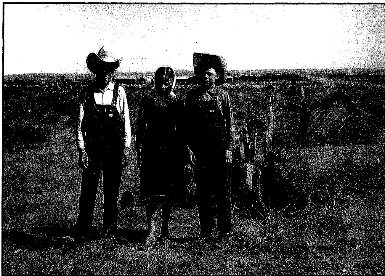
Conservative Old Colony Mennonite children in Central Mexico.

pants ranged from less than a year to more than three years.