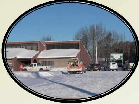
Town of La Ronge