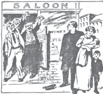
The High River Times , 1 July 1915,