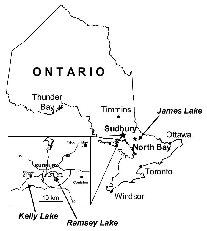
Fig. 1. Map showing locations where experiments were conducted in North Bay (James Lake) and Sudbury (Ramsey and Kelly lakes), northern Ontario, Canada during the summer of 2002.

sponse. However, injured fish skin includes amino acids that may cause swordtail skin to be somewhat attractive to darters.