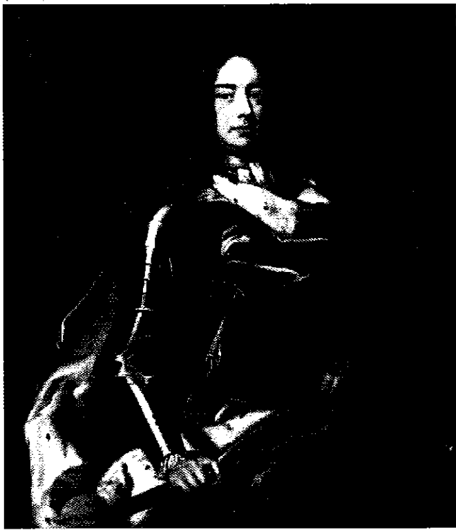
The First Duke of Marlborough

powerless, and of which the history of war furnishes no equal example. The two men took to one another from the outset. They both thought and spoke about war in the same way, measured the vast forces at work by the same standards, and above all alike looked to a great battle with its awful risks as the means by which their problems would be solved. 4