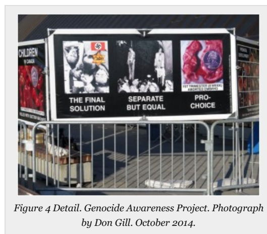
Figure 4 Detail. Genocide Awareness Project. October 2014.

As we have seen CBR/CCBR is very strategic and purposeful in their campaign design. Lawrence Breitler’s renowned photograph of the hanging and tortured bodily remains of African American men, Thomas Shipp and Abram Smith was chosen to elevate the spectator’s sensation of brutality (similarly evocative but historically distinct are the holocaust images). During the 1930s lynching incident the young men were dragged by a vigilante mob from a jail cell, where they were being held on suspicion of murdering a